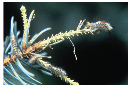
Figure 4: Douglas fir tussock moth larval damage

The adults emerge from late July through mid-August. The males are winged and are strong fliers, but the females have only minute, non-functional wings. Mating occurs in the immediate vicinity of the female pupal case and they then lay their characteristic mass of eggs covered with grayish hairs. There is one generation produced per year.