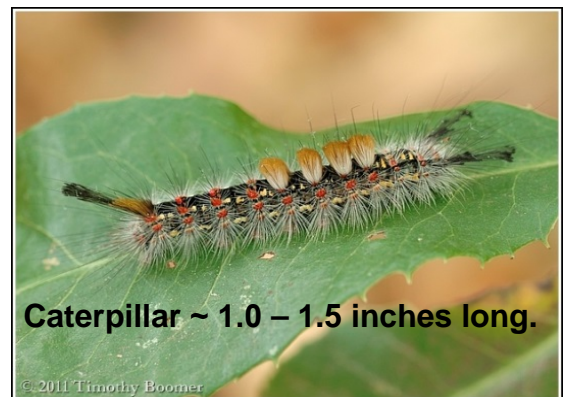
Caterpillar ~ 1.0 – 1.5 inches long.