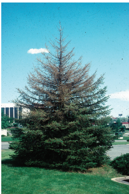
Figure 5: Top-down defoliation pattern typical of Douglas fir tussock moth.

Outbreaks of Douglas-fir tussock moth are cyclical due to effects of several natural controls. At least seven species of parasitic wasps and a tachinid fly have been identified as parasites that are locally present. Caterpillars may be killed by general predators, notably spiders. A nuclear polyhedrosis virus disease, known as the "wilt disease", also can be an important mortality agent during outbreaks. Bird predation on tussock moth caterpillars is considerable during the early larval stages but the longer, dense hairs on larger caterpillars makes predation by most bird species difficult. In addition, severe weather, particularly following egg hatch, can be important in