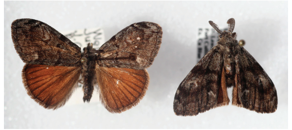
Figure 1: Adult moths of the Douglas fir tussock moth.

Douglas-fir tussock moth spends the winter as an egg within the egg mass. Eggs hatch in the spring, often in late May, typically following bud break. The small, hairy caterpillars migrate, moving to the new growth but also often dispersing upwards in the trees. This latter habit allows some of the caterpillars to be dispersed by winds, which will carry the small, hairy caterpillars. Since the adult female moths do not fly, wind-blown movement of young larvae is an important means of initiating new infestations.