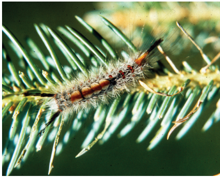
Figure 3: Douglas fir tussock moth larvae.

The caterpillars first feed solely on the newer foliage, and partially eaten needles may wilt and turn brown. Later, the older caterpillars will move to older needles as the more tender needles are eaten. During feeding, particularly when disturbed, larvae may drop from branch to branch on long silken strands. By mid-July or August, the larvae become full grown and many may migrate away from the infested tree. They pupate in brownish spindle-shaped cocoons in the vicinity of the infested trees.