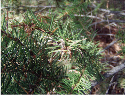
Figure 6: Douglas fir tussock moth larvae with a disease, nucleo-polihydrosis virus.

limiting Douglas-fir tussock moth populations. The cumulative effects of these natural controls rarely allow Douglas-fir outbreaks to persist more than a couple of years before reverting to a normal non-damaging population level.