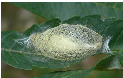
Cocoon – frequently under eaves, rocks, etc. where they are protected.