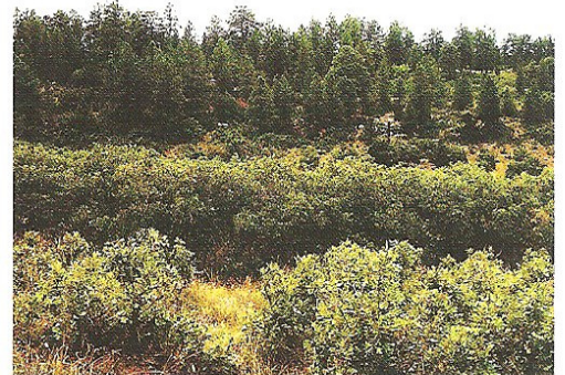
Figure 1. Typical oak brush growth in Colorado.

Gambel oak ( Quercus gambelii ), commonly found throughout western Colorado between 6,000 and 9,000 feet in elevation, generally dominates the region between the lower piñon-juniper zone and the aspen or ponderosa pine zone above. This shrub can be found throughout southern Colorado and along the Front Range almost to Denver. Gambel oak is usually found in conjunction with serviceberry ( Amelanchier alnifolia ), snowberry ( Symphoricarpus oreophilus ), mountain mahogany ( Cercocarpus montanus ), chokecherry ( Prunus virginiana ) and a variety of forbs and grasses. In south-central Colorado, oak brush is often associated with sumac and New Mexico locust.