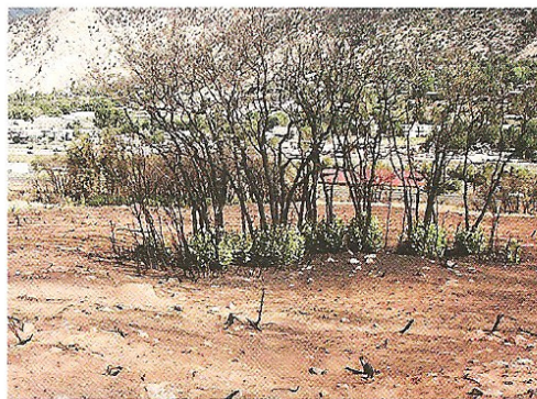
Figure 2. Oak brush sprouting after fire.

Gambel oak rarely reproduces from acorns; most reproduction is vegetative with sprouts occurring from a deep, extensive root system. Clones of oak brush spread slowly but stubbornly persist in previously colonized areas.